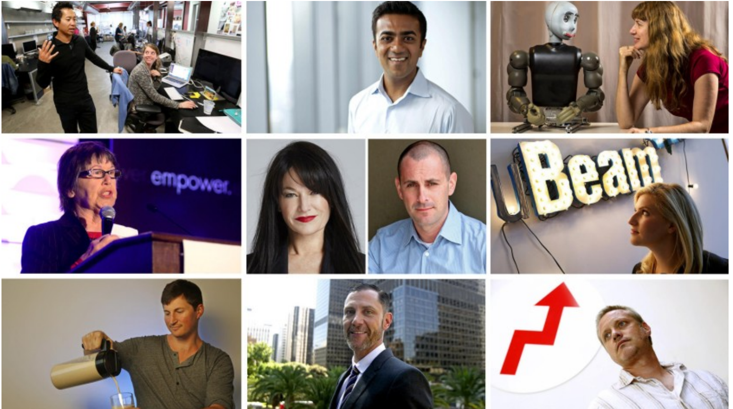
Tech power players in Los Angeles.