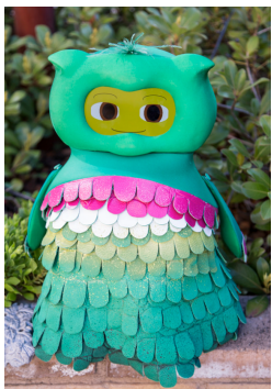
Figure 3: Kiwi the SpriteBot [4]