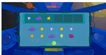
Figure 4: "Code Copying" Activity in Alien Codes from Expedition Deployment built with Phaser led by Eric Deng