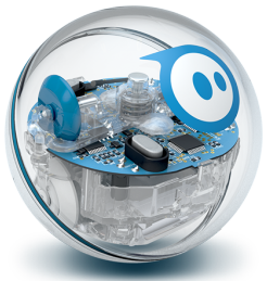
Figure 1: Sphero SPRK+ Robot

We are interested in exploring expressive behaviors in minimal social and socially assistive robots. Toward that end, we explore the use of a robot or group of robots' physical embodiment as a natural communication channel. In this work, we describe how concepts of mime can be used to develop robot behavior controllers that enable minimal robots to convey information about non-present physical