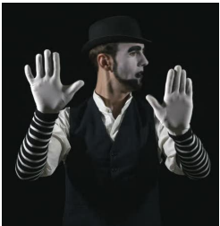
Figure 2: Mime artist miming a non-present wall