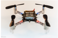
Figure 3: Crazyflie Quadrotor

to the semantics of speech, adding detail to mental images through the use of body language. Affect displays convey emotion and help to clarify the relationship between an agent and another agent or object. By using iconic gestures and affect displays, we can allow simple robotic systems to construct mental images of objects being gestured and then communicate its perception of those objects to their human counterparts.