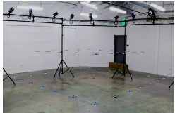
Figure 4: CrazySwarm: 49 vehicle formation flight [12]

To create even richer embodied interactions, we can further augment our mime-inspired behaviors by using channels of communication that robots may have that mimes do not. Two examples of such channels are sound and color . Work in visual and graphic design has associated different colors with different emotions and different branding themes, which can be used to advise robot coloration in different interaction contexts. In sound design and human-robot interaction work other researchers have explored how humans perceive different sounds that vary in tone, intensity,