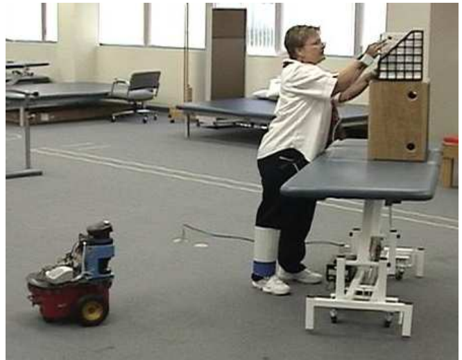
Fig. 2. The robot and a stroke patient during an experiment, where the desired activity is to shelve books. The arm sensor is visible on the patient's right forearm; the patient also wears laser fiducials on her leg to make it easier for the robot to recognize and follow her.

The robot uses a standard Pioneer2 DX mobile robot base. A SICK LMS200 scanning laser range finder enables it to find and track the patient's legs. For obstacle avoidance, the laser was used together with the on-board ultrasound array. A Sony pan-tilt-zoom (PTZ) camera enabled the robot to "look" at the patient and away, shake its "head" (camera), and make other communicative actions. The camera could also be used to find and track a patient wearing colored markers (as was done in an earlier set of experiments we performed). A speaker produced pre-recorded or synthesized speech and sound effects. To monitor arm movement, the patient wore a sensor based on an inertial measurement unit (IMU), which sent data wirelessly to the robot in real time.