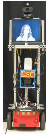
Fig. 1. An image of Clara

Clara is constructed with standard off-the-shelf products. Mobility and primary battery power are provided by an ActivMedia Pioneer 2 DX robotic mobile platform. A 1 GHz Pentium III computer running Gentoo Linux resides inside, controlling the motors and providing basic I/O support. The sensors on the robot include a laser range-finder, a camera, and a microphone. The laser is a SICK LMS200 with a 180° field of view, used for obstacle avoidance and localization; its height was chosen so that the feet of the hospital beds could be reliably detected. The vision system consists of a Sony EVI-D30 pan-tilt-zoom camera with a 640 × 480 frame-grabber. This video signal is fed through to an ACTS color-tracking server, which provides color blob detection. Acoustic perception is generated with a Shure 503BG unidirectional dynamic microphone designed for computer voice