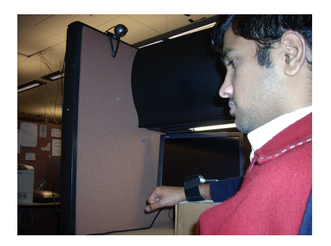
Fig. 3. A participant performing the WMFT assessment. The participant is being monitored by an overhead camera and an IMU on the wrist.

The participants wore an IMU on the wrist of the arm being tested, and were monitored by an overhead camera (Figure 3). There are markings on the table, used by the monitoring system to determine when various task success conditions have been met. The participants performed tasks from the WMFT (Tasks 1, 2, 3, 4, 5, 6, and 8, listed in Table II. These tasks were chosen because they require only the IMU and overhead camera). Two participants were recruited for the study. The participants were healthy individuals with no apparent motor limitations.