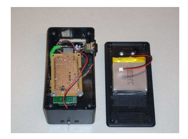
Fig. 2. The central controller worn on the participant's body contains a computer (Gumstix), battery, DC-to-DC converter, and a plastic housing.

(including the I^2C and SPI data transmission protocols) is readily available. An advantage of the Gumstix platform is that it lends itself to development for various software suites, such as the open source Player/Stage development environment that we have employed [12]. The entire system is called the motion suit, and is pictured in Figure 1.