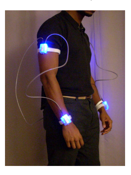
Fig. 1. The motion suit worn by the participants consists of the IMUs and wearable computer. In our experiments, only one IMU is used.

The IMU sensor outputs are low-pass filtered (using analog filters) and sampled by a 10-bit ADC. An Atmel© AT-mega324 microcontroller reads the digitized sampled data, arranges them into individual packets, and transmits each packet (along with a timestamp) to the central computer using the I<sup>2</sup>C bus interface. Each IMU is enclosed in a custom plastic enclosure and secured to the user using a Velcro strip (Figure 1). The lightweight enclosure has a concave shape in order to contour to the human body.