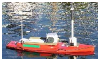
Roboboat - Researchers from USC are working with a roboticist to study the effects of red tide on harbor waters using a radio-controlled boat.

The team will return in April to collect more samples and track any developments in toxic