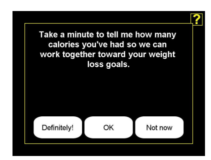
Fig. 3: A screen showing spoken text printed to screen.

The control flow of the interaction is the most complicated part of the software system created for the robot. The basic flow is written to be easily modifiable, which allowed for rapid changes based on early and ongoing feedback that was solicited on the interactions with the system. There are a number of factors that can change what the robot says or does at a given instant.