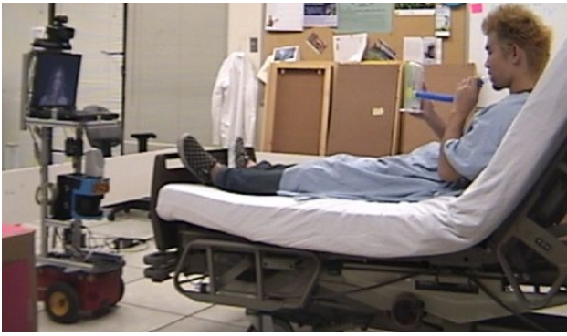
Fig. 4. Clara (without covers) assisting a patient with the spirometry exercise

the use of verbal games, sounds, and robot movement. Furthermore, alterations to the physical appearance of the robot will be investigated as an additional path toward patient motivation and engagement.