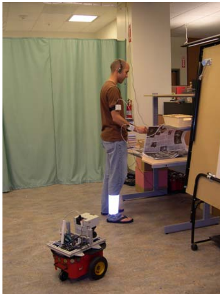
Figure 3: The participant is performing turning pages of a newspaper task with the robot at a social distance. The laser fiducial is on the participant's right leg, the motion capture sensor on the right arm, and a microphone is worn on standard headphones.