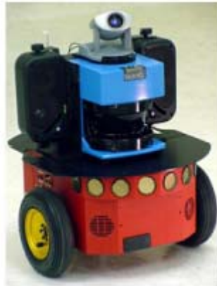
Figure 1: The Pioneer mobile robot base used in the experiments. Shown is the laser (the blue box), camera (mounted on top of the laser), and speakers (mounted on each side of the laser).

The robot used for our experiments, shown in Figure 1, consisted of an ActiveMedia Pioneer 2-DX mobile robot base, equipped with a SICK LMS200 laser rangefinder used to track and identify people in the environment by detecting reflective fiducials worn by users. A Sony pan-tilt-zoom (PTZ) camera allowed the robot to “look” at and away from the participant, shake its “head” (camera), and make other communicative actions. A speaker produced pre-recorded or synthesized speech and sound effects. The IMU-based motion capture unit provided movement data to the robot wirelessly in real time. The entire robot control software was implemented using the Player robot control system [33].