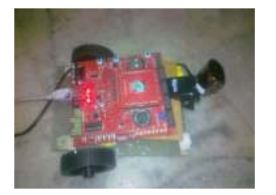
Fig 7.Internal structure of the robot

side of that boat . ATMEGA 128 microcontroller of this robot is an advanced controller with many features inbuilt in it. Analog module of temperature sensor is connected to the inbuilt ADC of microcontroller, two USART of this controller make our work very easy as one USART is connected to the GSM module and other is to the CC2500 module for radio transmission and receiving. Six ports give us a wide variety of pins to fix many modules like water sensor, ultrasonic sensor, motor driver IC. In addition to these it also have inbuilt two wire protocol (I2C) which help us to communicate to the robot to and fro.