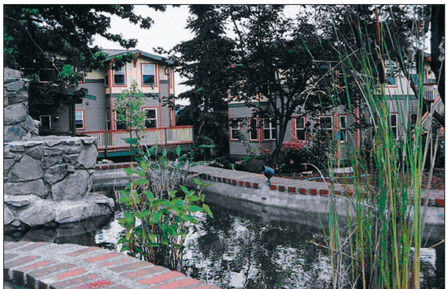
Figure 1. Gardens of the Oatfield residential cluster with pervasive but unobtrusive sensors.

The sensors and infrastructure also allow easy trend monitoring for each resident, according to Easter. For example, if a resident's blood pressure or weight changes, the resident's physician might need to be called. The same databases let the staff clearly communicate with the resident's adult children about changes