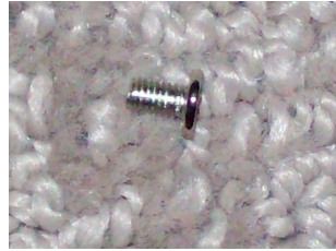
Figure 4: Small screw

Participants cannot fully represent all possible environments in which individuals with motor impairments might live, the observation of modifications to the living environments for wheelchairs suggests the viability of using mobile robots on wheeled bases. The pictures also illustrate some potential challenges for the development of the assistive robot. In Figure 5 the sunlight was reflected by the tiled floor creating a bright glare which would make it difficult for the robot to visually segment the object from background. Figure 6 shows a desk with many objects placed in cluttered fashion which might make it difficult for the robot to distinguish which object is actually the target object.