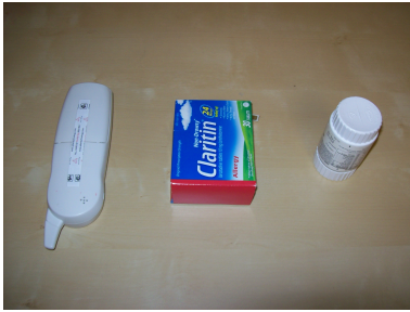
Figure 13: Objects; a cordless phone, a paper medicine box, and a plastic medicine bottle

users perspective position A is on the left and position B is on the right. The two positions were selected to represent different directions and distances from the robot as listed in Table 3. When placed in these two positions the objects were in plain sight of both the robot and the participant. 3D estimation of the point detected by the robot was compared with the object location to calculate the 3D distance between the objects actual locations and detected points.