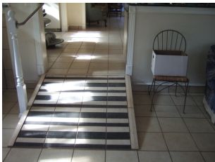
Figure 5: Shining sloped floor

Participants cannot fully represent all possible environments in which individuals with motor impairments might live, the observation of modifications to the living environments for wheelchairs suggests the viability of using mobile robots on wheeled bases. The pictures also illustrate some potential challenges for the development of the assistive robot. In Figure 5 the sunlight was reflected by the tiled floor creating a bright glare which would make it difficult for the robot to visually segment the object from background. Figure 6 shows a desk with many objects placed in cluttered fashion which might make it difficult for the robot to distinguish which object is actually the target object.