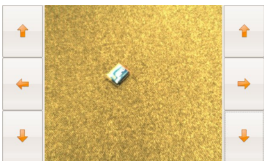
Figure 11: Touch Screen Interface

We implemented the touch screen GUI on a computer separate from the robot and located in close proximity to the user as shown in Figure 12. The GUI has a large area in its center that displays images from the robot’s right stereo camera. On the left and right side of the image, we included