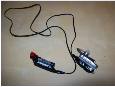
Figure 9: Ear-mounted laser pointer and a wired button