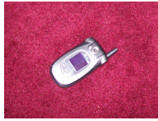
Figure 2: Cell phone