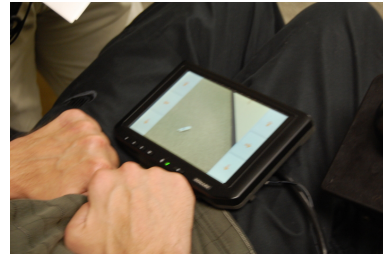
Figure 12: The touch screen interface being used by a participant