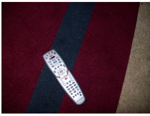
Figure 1: TV remote