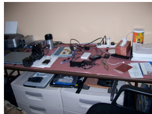
Figure 6: Cluttered space floor

Other than object retrieval, different tasks were also reported as difficult through the participants' photographs and recordings. A participant had difficulty in holding and moving a hairbrush due to limited hand dexterity. Similar to this, putting on socks, shirts, and shoes was one of the common tasks with which participants experienced difficulty. Opening food containers and controlling switches were also reported as a source of difficulty for some participants. Although the robot developed for this study focuses on the ob-