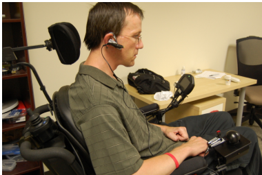
Figure 10: Ear-mounted laser pointer worn by a participant

readily detect the illuminated location. To enhance the detection of the laser spot with the omnidirectional camera and to increase the sensitivity, the robot uses a narrow-band green filter matched to the specific frequency range of the laser pointer. After detecting the spot, the robot looks at it and estimates its 3D location using the stereo camera.