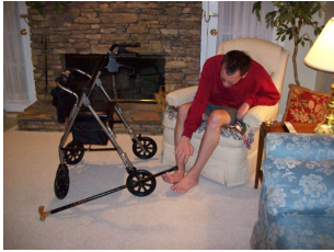
Figure 3: Walking stick