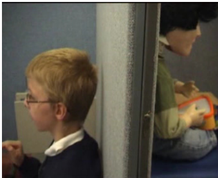
(c) Child participant playing the game with the 'disembodied' robot in the sound only condition , where the robot is hidden but audible and only its drumming sound is heard.

Fig. 2 Screenshots from the experiment with children where they played (a) with the physical robot, (b) watching a projected image of the robot, and (c) hearing only the sound of the robot