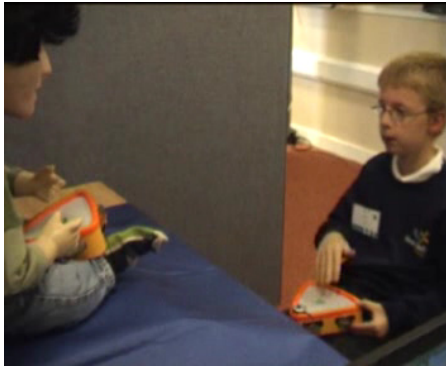
(a) Physically embodied robot, Kaspar and child participant