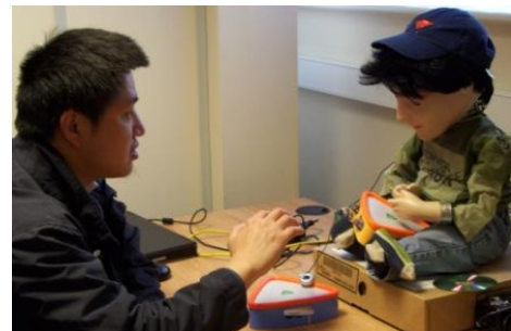
Fig. 1 A screen shot from the experiments

The third experiment (with children) was carried out in two almost identical cubicles isolated from the rest of a room with high barriers (Figure 2). In the rest of the room other robotic activities took place at the same time with other children. In one cubicle we had Kaspar seated on a table with the drum on its lap, similar to the first two experiments. In the second cubicle instead of the table and the robot Kaspar, we projected a real time image of Kaspar on a whiteboard, in order to study the effect of the robot’s embodiment (physically present versus remotely located). For the third condition, where only the sound of the robot was heard (disembodied robot), we use the same setup but turned off the projector. (See Figure 3). All other aspects of the experimental setup were kept the same.