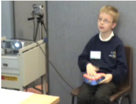
(b) Child participant is playing the game in the projection condition where the robot's live performance is captured by a camera and projected to a wall in front of the child.