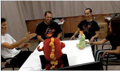
Figure 2: The multi-party interaction experiment setup.