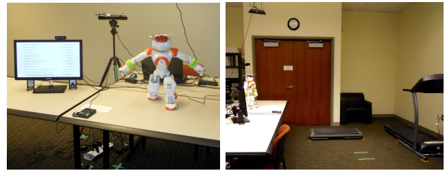
Fig. 1. Robot exercise buddy experiment setup. Left: Robot performing a split squat with an arm raise to the side. Right: Robot, step, and treadmill setup. Participants exercised in the space between the table and treadmill.

The experiment setup is seen in Figure 1. The humanoid robot, a Nao Next Gen V4, was placed on a table so as to be close to or slightly below eye level of the participant. A monitor next to the robot displayed the exercise sequence for the session, including the name and number of repetitions or duration for each exercise. It was also used to show demonstrations of each exercise. A keypad was placed between the robot and the monitor. Using this keypad participants could respond to questions from the robot using keys labeled “Yes” and “No”, inform the robot of being done with a set of exercises using a key labeled “Done”, and stop or pause the interaction with a key labeled “End”. The robot autonomously responded to these inputs based on a pre-determined script. A 3D Vision (Kinect) sensor hanging from the ceiling and an Augmented Reality (AR) tag on top of the robot’s head were used to capture the position of the robot. The robot used this position information to autonomously move back to its starting position after exercises that involved foot movement. An exercise step and treadmill were also in the exercise area. The robot wore either green or orange wristbands, and the color of these was switched between the two backstories to indicate that the backstory was different. The pre-determined scripts for what the robot with each