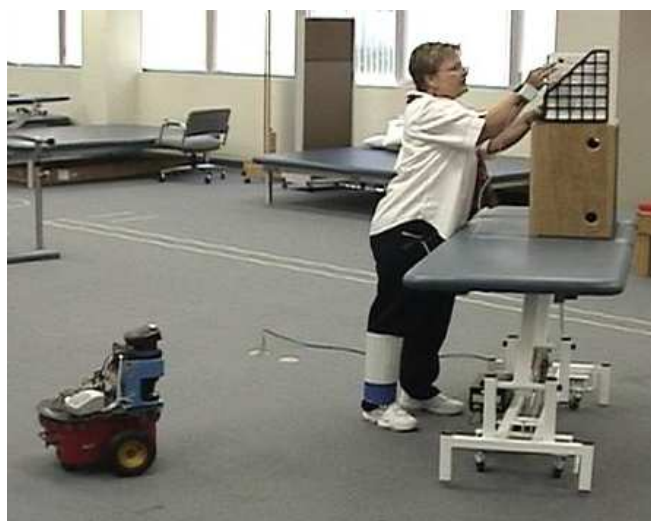
Fig. 2. The robot and a stroke patient during an experiment, where the desired activity is to shelve books. The arm sensor is visible on the patient’s right forearm; the patient also wears laser fiducials on her leg to make it easier for the robot to recognize and follow her.

The robot uses a standard Pioneer2 DX mobile robot base. A SICK LMS200 scanning laser range finder enables it to find and track the patient’s legs. For obstacle avoidance, the laser was used together with the on-board ultrasound array. A Sony pan-tilt-zoom (PTZ) camera enabled the robot to “look” at the patient and away, shake its “head” (camera), and make other communicative actions. The camera could also be used to find and track a patient wearing colored markers (as was done in an earlier set of experiments we performed). A speaker produced pre-recorded or synthesized speech and sound effects. To monitor arm movement, the patient wore a sensor based on an inertial measurement unit (IMU), which sent data wirelessly to the robot in real time.