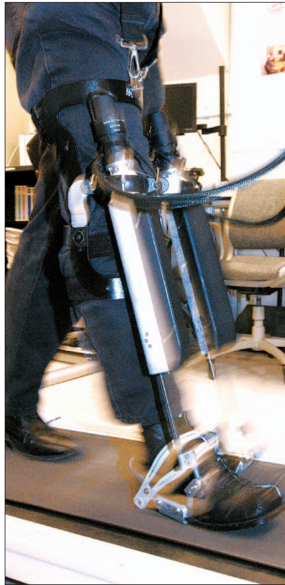
The Anklebot helps improve movement in paralyzed ankles.

"As far as we know, we were the first to use robots to deliver therapy in continuous