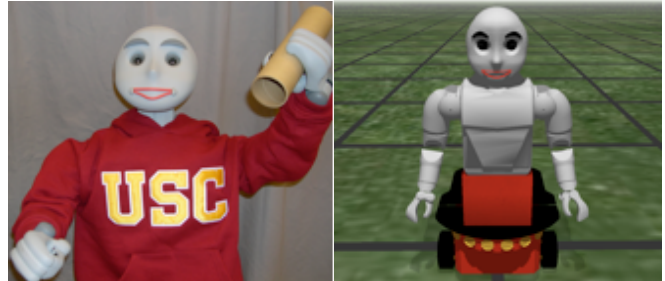
Fig. 2: The Bandit III upper-torso humanoid robot platform atop a Pioneer P2 base; physically embodied (left) and simulated (right).

grabber open and close; left and right arms), 2 in the head (pan and tilt), 2 in the lips (upper and lower), and 1 in the eyebrows. These high degrees of freedom allow the robot to be expressive by using individual and combined motions of the head, face, and arms. An extensive gesture and facial expression library has been developed to enhance the interactive experience. We are particularly interested in utilizing Bandit's anthropomorphic—but not highly realistic—appearance as a means of establishing user engagement, and comparing its impact to our prior work with non-anthropomorphic robot test-beds [11, 12, 13, 14]. The robot is more to scale with respect to human users than many other humanoid platforms; mounted atop a Pioneer P2 base, the entire robot is one meter tall, making it well suited for interaction. (For safety reasons, the robot was placed outside of the experiment workspace. In addition, a large 'kill-switch' button is built into the robot for use in case of any emergency.)