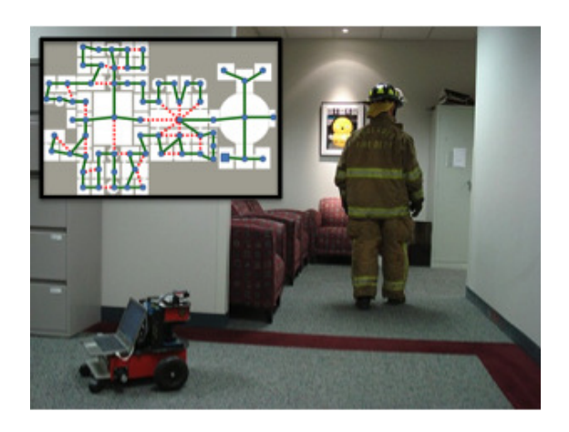
Figure 1: Pioneer robot searching a building with a team of volunteer firefighters. A graphical representation of the building is shown in the top left. The robot and humans coordinate using a provably near-optimal distributed algorithm that combines submodular optimization and pursuit-evasion [9, 10, 15, 20].

With a focus on scalability and guarantees, my collaborators and I developed the first distributed approximation algorithm for the multi-robot efficient search problem [15]. By utilizing the property of submodularity, the formalization of diminishing returns, I was able to show guarantees on performance. The algorithm generates solutions competitive with general solvers while maintaining linear scalability in the number of robots. I implemented this approach on a state-of-the-art mobile manipulator at Intel Research Pittsburgh [20], and the work was recognized as a finalist for the Best Student Paper Award at the Robotics: Science and Systems Conference in 2008 (conference acceptance rate 24%) [14]. For the case of an adversarial target, I proposed the first "anytime" algorithm in that domain that quickly finds a feasible solution and then continues to generate improved solutions with increasing running time [9]. This technique has become a benchmark in the field, and researchers at Carnegie Mellon University, University of Pittsburgh, and Linköping University are currently extending its capabilities [18].